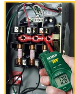
Troubleshooting for hot spots